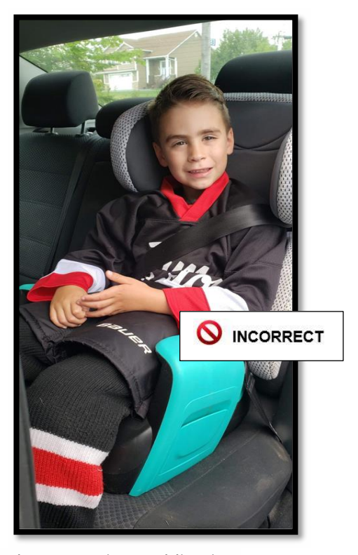
As seen above, wearing padding in a vehicle, will significantly affect seatbelt fit. Shoulder strap is incorrectly sitting too low on the childs arm, and the belt is fitted to hockey gear rather than the childs body.

Hockey parents can all agree, rushing to the rink on time, navigating the chaos of the change room and getting their player suited up, is hectic on a good day. With social distancing regulations in place it's tempting to suit up your player before arriving at the rink- while hockey gear is designed to keep kids safe on the ice, it can potentially put them at risk in the vehicle. Shoulder and chest pads, padded pants and other hockey gear will impact the harness or seatbelt fit, significantly reducing its effectiveness.